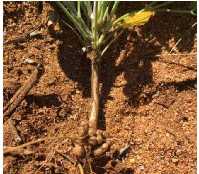
Close-up of tedera nodules (top) and a nodulated seedling (bottom).