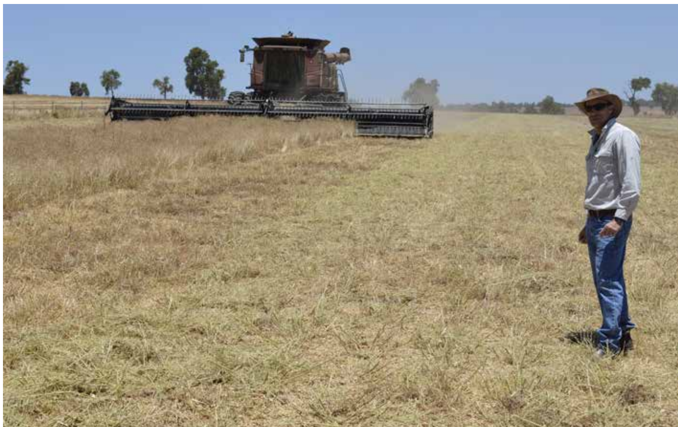
Lanza® tедера harvesting from desiccated seed crop at Dandaragan.

Paraquat and diquat are effective desiccants in adult tедера plants, which can recover well after treatment.