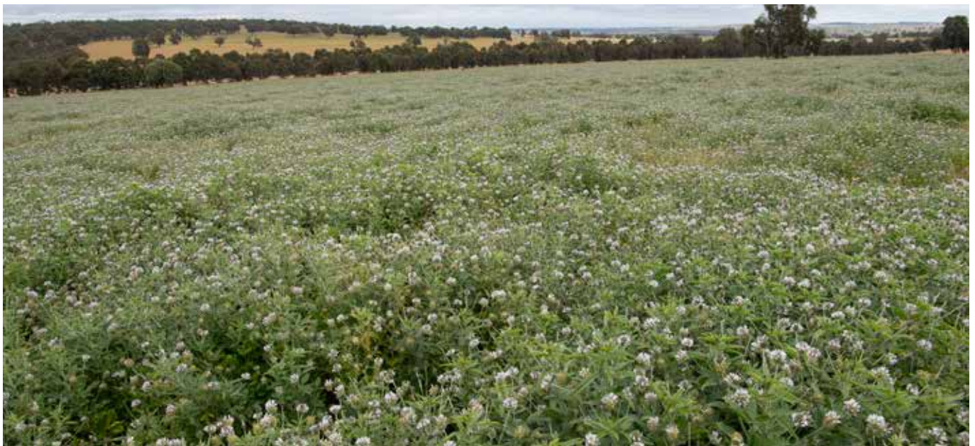
Tедера at flowering.

Bituminaria bituminosa C.H. Stirton (tedera) is widely distributed in all countries surrounding the Mediterranean Sea. It is a diverse species with many botanical varieties adapted to regions with 150–1,000mm of annual rainfall, from sea level to high altitude, and from regions with no frosts to cold mountain climates.