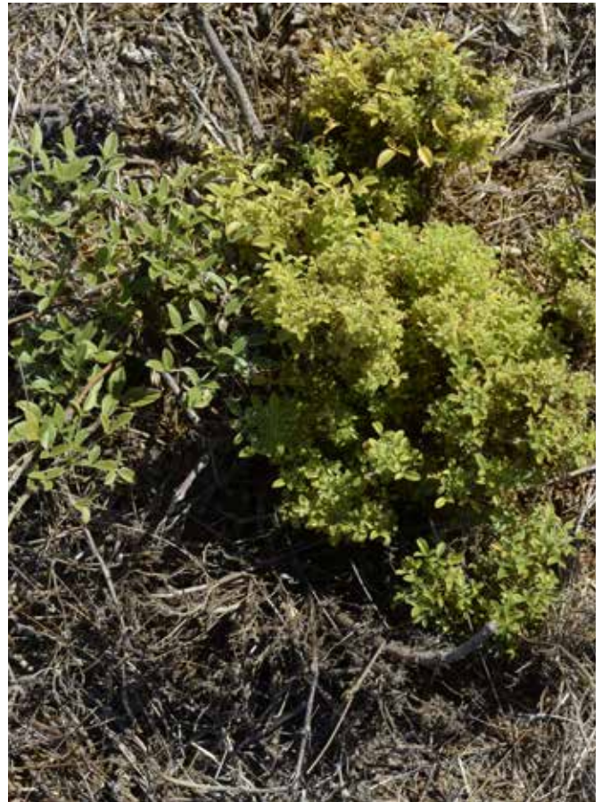
Tедера with parts of the plant showing phytoplasma (BiWB) symptoms and part of the plant growing normally.

Phytoplasma are phloem-inhabiting bacterial organisms transported via leaf-sucking insects, such as leafhopper. Phytoplasma causing 'witches' broom'-type symptoms including stunted growth, with small leaves, shortened