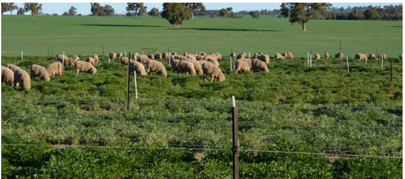
Sheep grazing tедера trials.