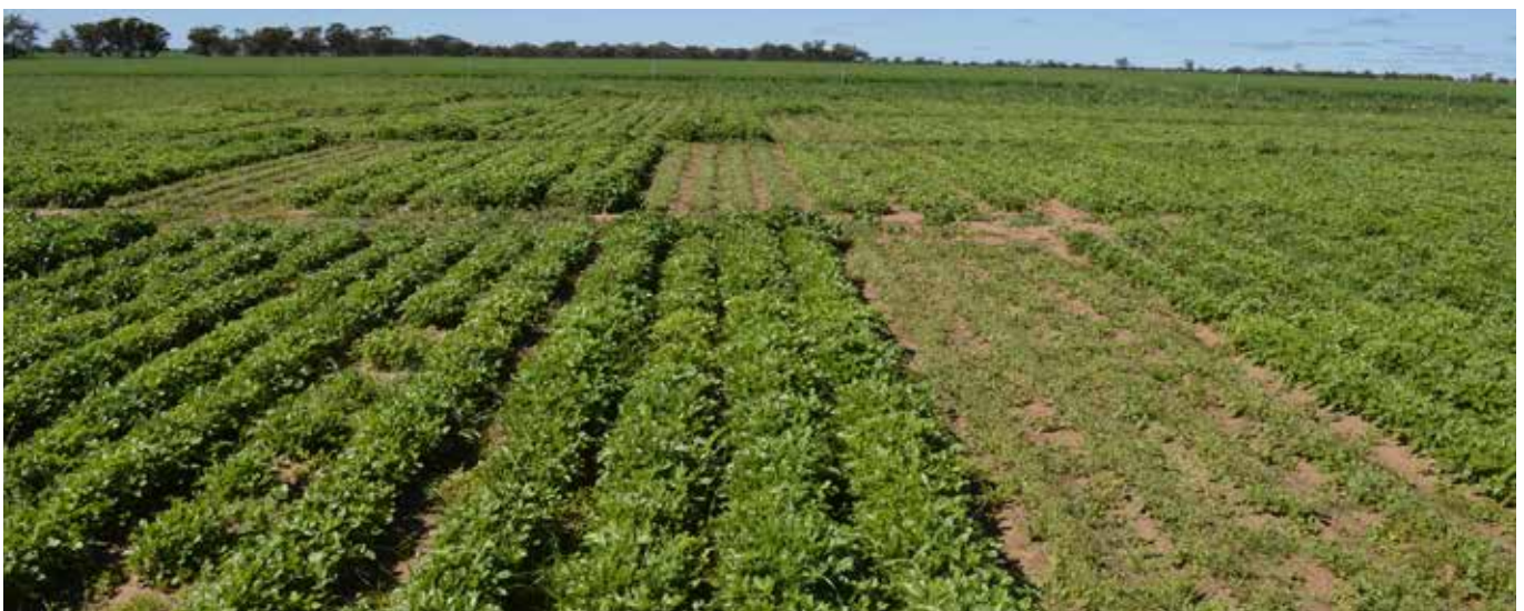
A defoliation experiment at Cunderdin in a one-year-old tедера stand in August, 2018. The experiment examined cutting the pasture to a height of five centimetres twice, four times or eight times a year.

Tедера productivity is maximised by grazing frequently during the drier periods and holding off grazing over the cooler months to support biomass accumulation and to allow roots to grow stronger and deeper.