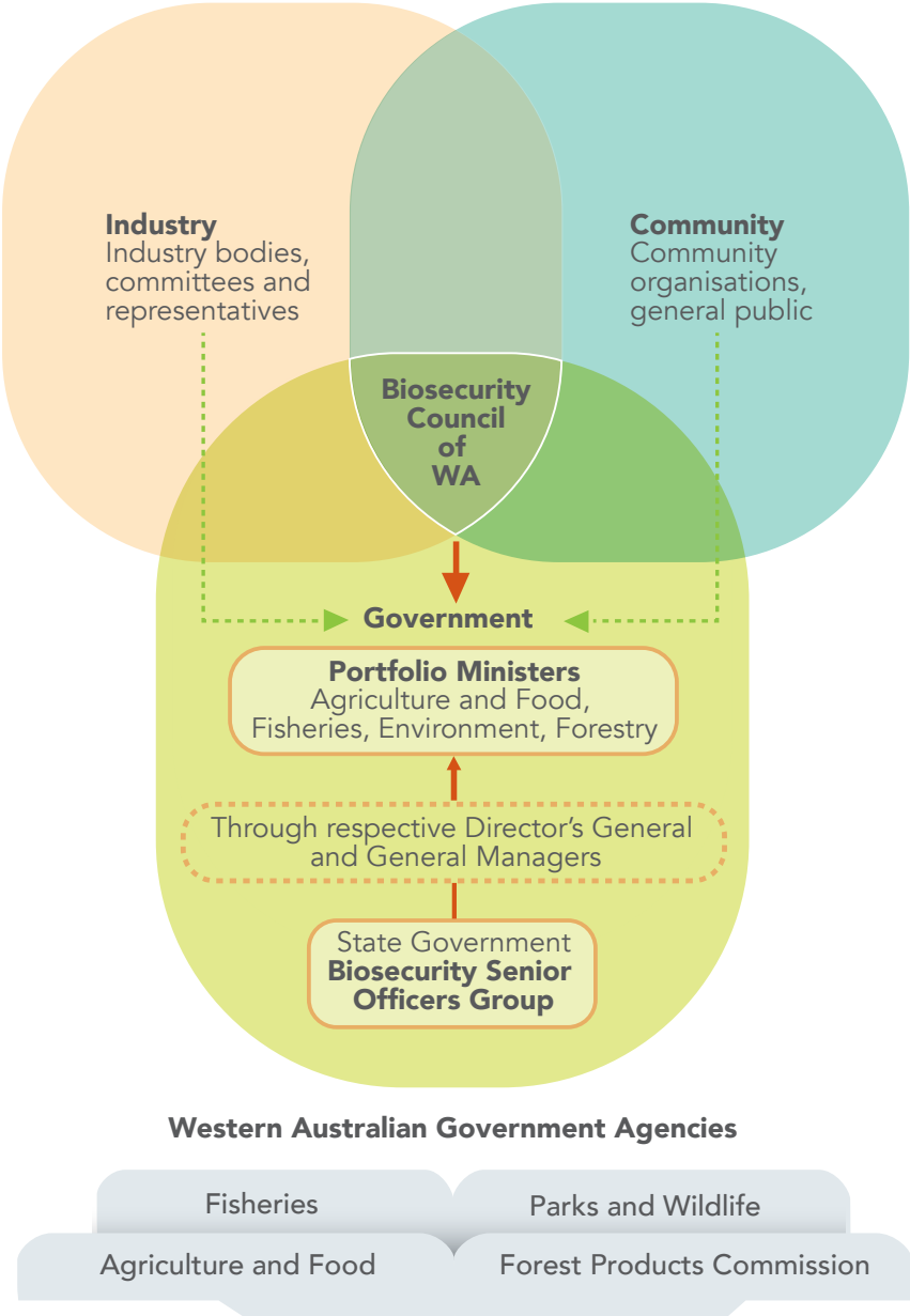
Figure 2 WA biosecurity framework for collaboration and advice

The Strategy emphasises the importance of shared responsibility (government, industry and the community) for the management of biosecurity in WA, which is underpinned by a framework for collaboration and advice (see Figure 2).