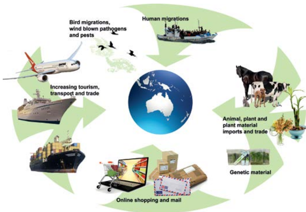
Figure 1 Examples of pathways that present biosecurity risks

Climate change may cause shifts in the potential range, habitat, spread and effects of pests and diseases. For example, the potential for severe weather events may assist the spread and establishment of some pests and diseases (e.g. via land degradation).