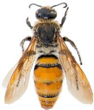
hairy flower wasp

There are a number of black and yellow flying insects commonly mistaken for European wasps. These may include other wasps, bees and flies.